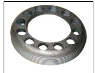
Typical Carrier Bearing Adjusting Nut (round holes)

The above information must be provided when ordering a replacement adjusting nut.